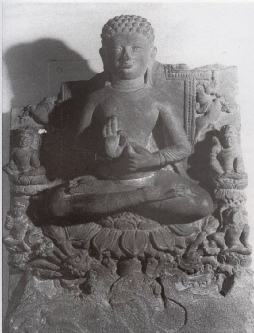
FIG. 3. Buddha displaying standard Dharmacakramudrā, Sarnath, Uttar Pradesh, India, Gupta period, late fifth century, sandstone. Sarnath Site Museum, Sarnath.

mānuṣi Buddhas are axiomatically representations of the Dharma, and thereby aspects of Vairocana. Therefore, it is not surprising that Śākyamuni is conflated with Vairocana and is understood to teach several sutras as simply Vairocana, as Śākyamuni/Vairocana, or as Śākyamuni in his Vairocana robes. 5