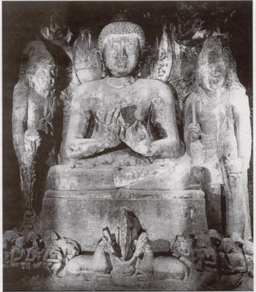
FIG. 1. Shrine image of Cave 4, Ajanta, Maharashtra, India, Vākāṭaka period, ca. late fifth century.